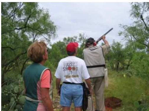
Competitors at the 28 gauge ring position