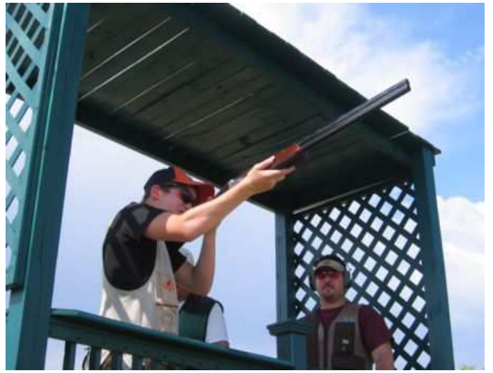
A long chondel at sporting station 11