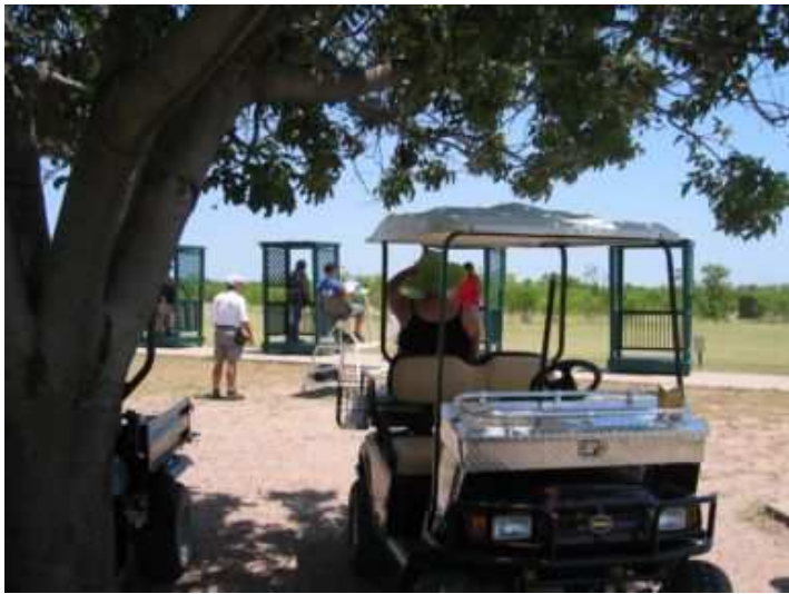
Enjoying the shade at the 5-stand