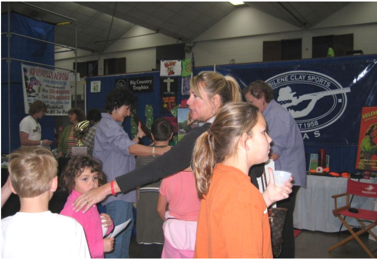
Kids lined up to handle the youth shotgun