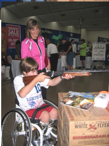
Abilene youth were able to handle a shotgun sized for their age group, many for the first time.