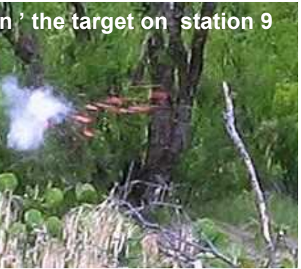
Bustin ' the target on station 9