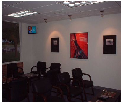
Lounge and Seating Area