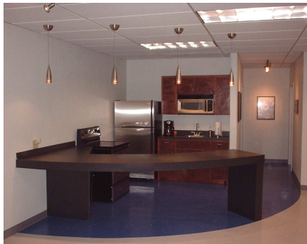
Kitchen and Serving Area